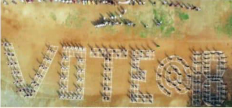
ఓటు అక్షరాల ఆకారంగా ఏర్పడిన విద్యార్థులు